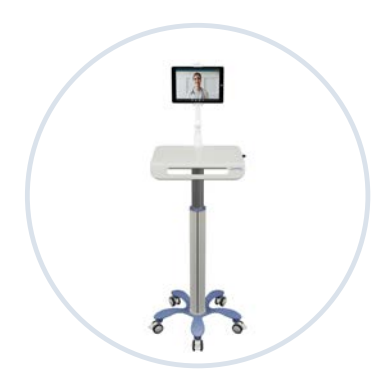
WORKFLO® Adjustable Height Non-powered Workstation (with tablet mount)