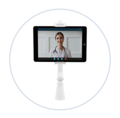
AccessMount Tablet Surface Mount Adjustable and Secure Mount